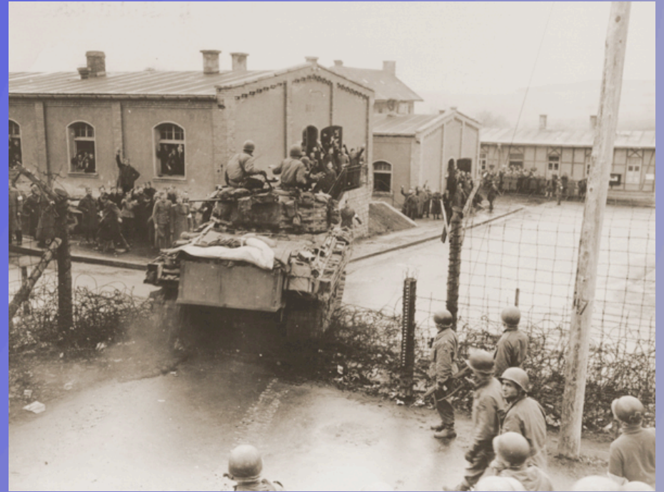
American troops liberate a camp.

Liberation by allied forces of those survivors held in concentration camps